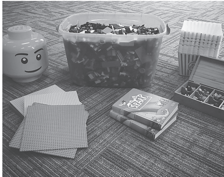
St. Thomas' Episcopal Church, Whitemarsh, Ft. Washington, Pennsylvania