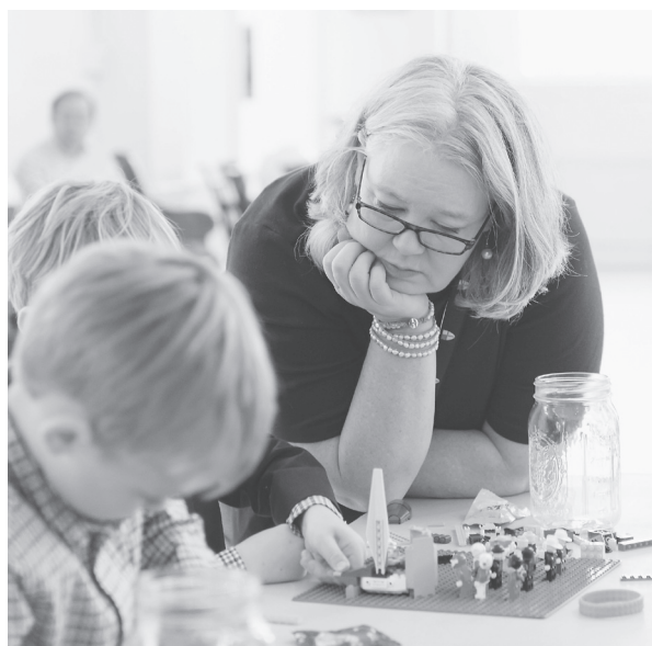
St. John's Episcopal Church, Georgetown, Washington, D.C.