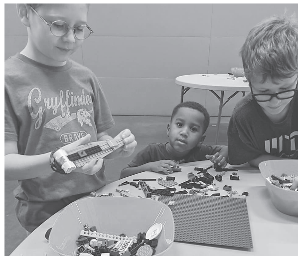
St. Cuthbert's Episcopal Church, Houston, Texas